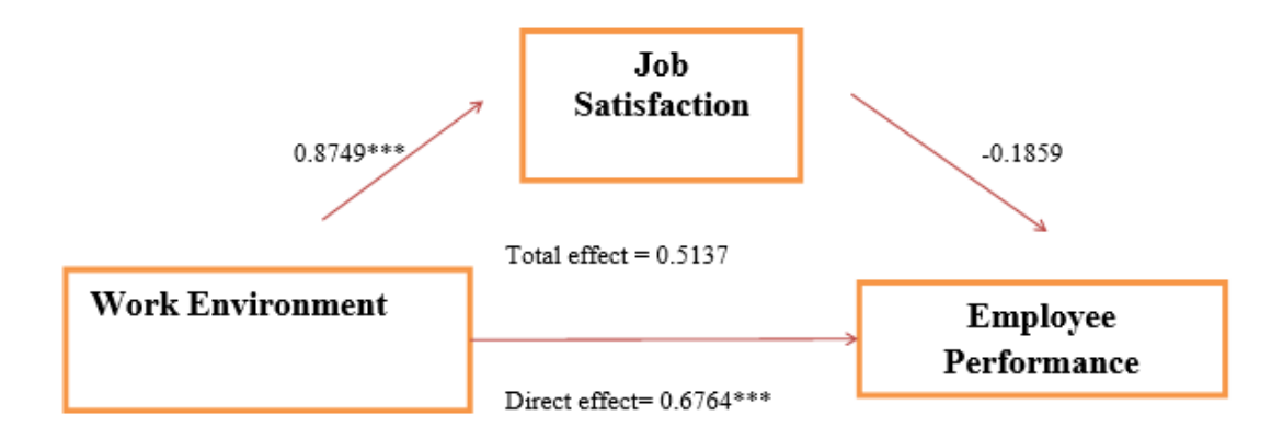
Figure (4.14) Path Analysis on Direct, Indirect and Total Effects of Job Satisfaction on Employee Performance

From the findings of Table (4.13), independent variable was positive and R-squared was 0.26 but satisfaction is not significant with employee performance which indicated that there is no mediation effect on employee retention at ICBC Bank.