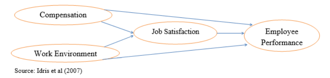
Figure (2.3) Mediating Role of Job Satisfaction on Compensation, Work Environment, and Employee Performance

Employee satisfaction affects the workplace and their productivity. It also boosts employee performance. Job satisfaction can directly or indirectly mediate between the work environment and employee performance. Direct or indirect. Bushiri (2014) studied the Dar es Salaam Institute of Financial Management to discover if work environment affects employee performance. Figure shows argument's conceptual framework (2.4).